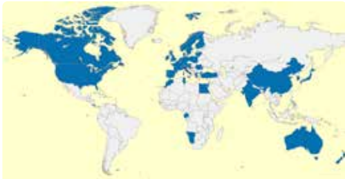
participating countries ■

Bio360 2025 is the global meeting point for all stakeholders from across the BioEnergy and BioEconomy communities focused on accelerating the biotransition, taking us from a fossil based economy to a renewable, circular economy.